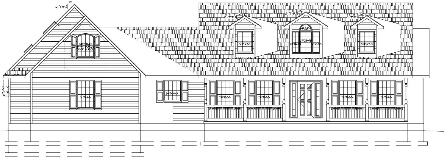
1 FRONT ELEVATION A-1 SCALE: 1/4"=1'-0"